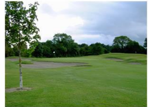
View into 8th green with new and rebuilt greenside bunkers

Bringing each feature of the course back into play in the earliest possible timeframe was always a consideration. The reshaping and reconstruction of existing greenside bunkers, with the addition of some new ones, was carried out very efficiently. The excavation and shaping was immediately followed by turving the bunker surrounds. During the work the temporary greens created by the Club were put into use. Immediately upon completion (usually within the same day) the flag was replaced in the permanent green, and the bunkers roped off as 'ground under repair' for play purposes. The next golfers