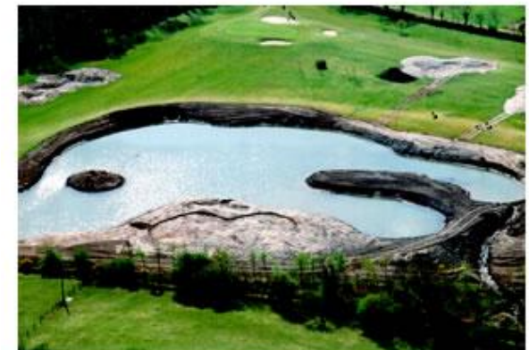
Aerial photo showing extension to lake at holes 1 & 2 Shaped subgrade for new 2nd green, and 'finger' in lake for new 3rd tees.