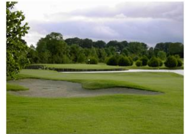
View into 10th green with new fairway bunker and new lake

holes and offer a different aspect to others, fairway bunkers that add new character and strategy to holes, reshaped and reconstructed greenside bunkers that are completely different than the existing. Probably the greatest impact came from the way in which the new lakes were brought into play. Not only do they look good and change the character of the respective holes immeasurably but in some areas they are a major factor in the improved drainage in that area. New pathways and bridges tie in a lot of these new elements. When completed, the golf course was vastly differently. It is now a golf course that is more challenging and more rewarding - a golf course that can compete with the best of its neighbours in the region - a golf course that is more sought after and desirable than previously.