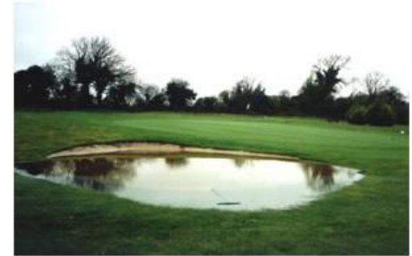
View of 5th green before start of upgrade works A typical problem of old bunkers is evident

After a number of design proposals and variations, some arising out of new problems emerging, and variations because of cost implications, the scheme agreed included some new greens, new tees, extensions to existing lakes and some new ones, new fairway bunkers, fairway mounding, the reshaping and reconstruction of all greenside bunkers, reshaping of an existing open drain and hundreds of metres of new pipe drainage. By now it was 2002.